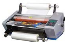
Matrix Duo 460/650