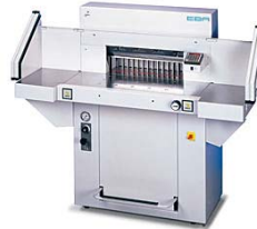
EBA 551 (LT)